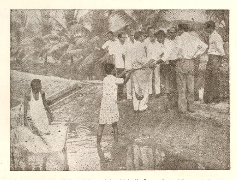
Participants of the 3rd workshop of the All India Co-ordinated Research Project on Brackishwater Prawn and Fish Farming being shown culture of Etroplus suratensis at the Kerala Centre of the Project at Vytilla Research Station of Kerala Agricultural University.