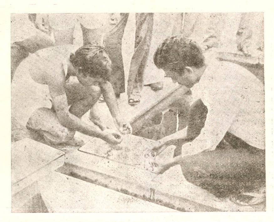
Trainees of the brackishwater prawn and fish farming course sorting-out sample collections at the farm pond of the Kakdwip Research Centre, Kakdwip, W. Bengel

dosage computation and treatment techniques evolved by the Institute. No adverse effect on fish fauna is likely or reported so far. The overall cost of clearance in this case is expected not to exceed Rs. 700/-per hectare which is one helf of the usual cost by manual clearance.